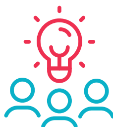
PROFESSIONAL KNOWLEDGE AND UNDERSTANDING